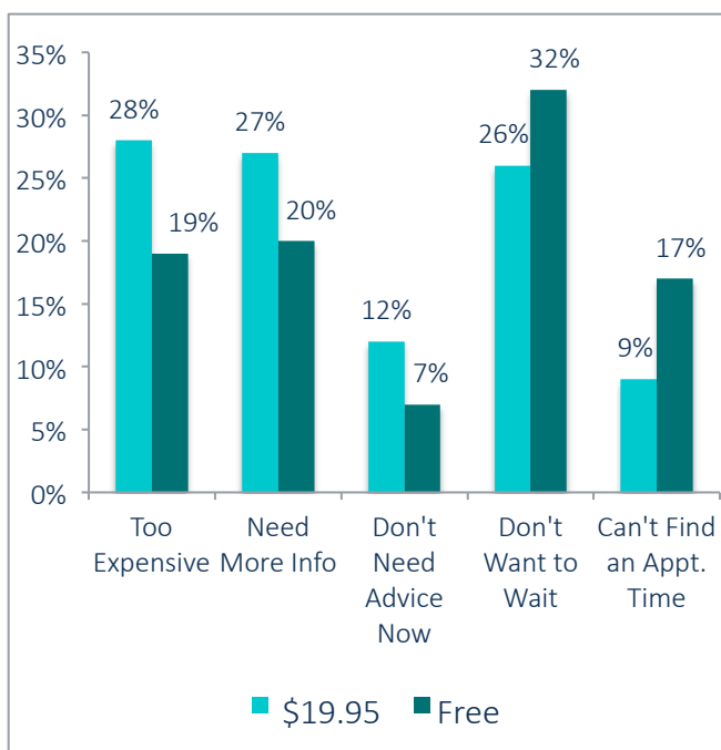
Figure 2: Top Five Reasons for Not Purchasing

Figure 2 clearly shows that cost is a factor. Combining the two price levels we see that the most-cited factor (between one-in-four and one-in-three) is that consumers do not want to wait. They prefer to have the service when they are seeking it out, and if they can not receive it then, they choose not to have the credit education. Related to this is the response that they can not find a workable appointment time. A little over one in three responses were that either they did not want to wait or could